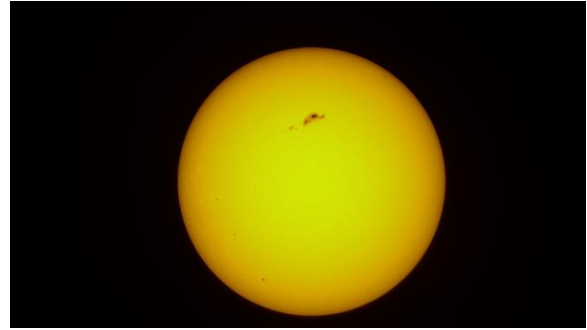
Taken with ED80 Explorer Scientific scope, Thousand Oak Optics Solar Filter, 6X Reducer/flattener Long Perng ASI290MC Camera, Skywatcher HelioFind Mount