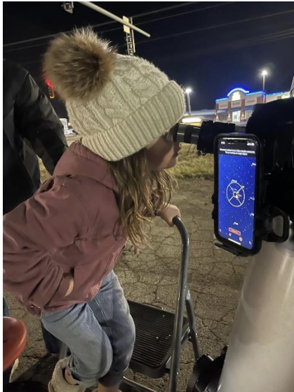
A visitor to one of RBAC's telescopes on February 19 th at Northtown in Highland.