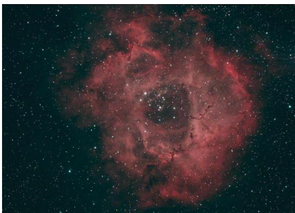
Rosette Nebula Taken with Sky Watcher Esprit 100 Camera; ASI 294 McPro Mount; SkyWatcher EQ6-RPRO Guide Scope; SW EVO50-290mc. One hour 18 minutes.