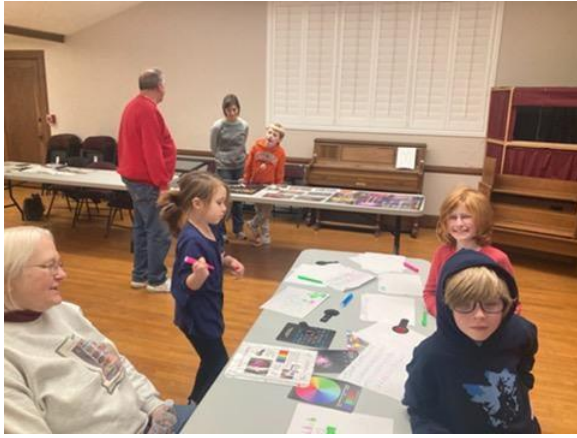
Sky puppies experiment with colors and filters.