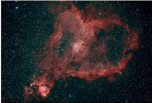
Heart Nebula, Taken with Celestron Rasa 8 Camera; ASI 294 Mc Pro Mount; Sky Watcher EQ6-RPRO; Two hours 10 minutes.